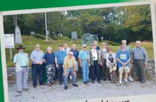
Well organised tours...