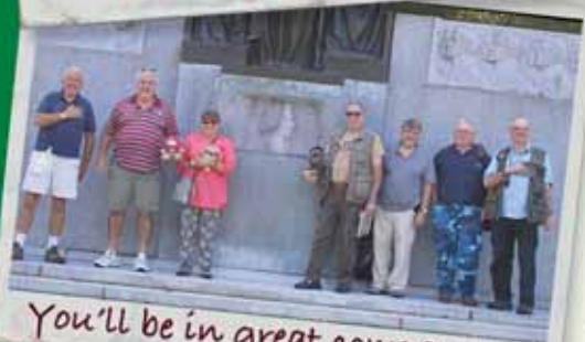
You'll be in great company...